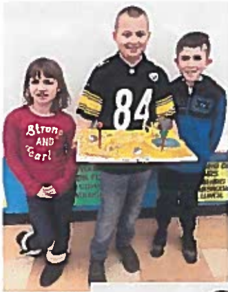
4 th Grade's Lion

Students researched and created an appropriate zoo habitat for their chosen animal.