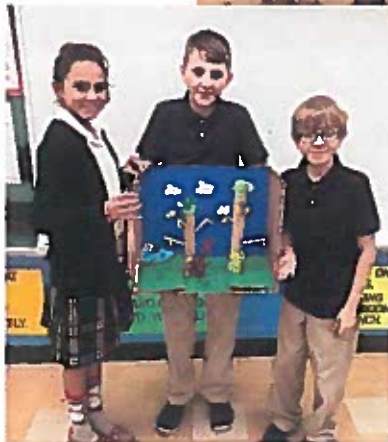
6 th Grade's Monkey