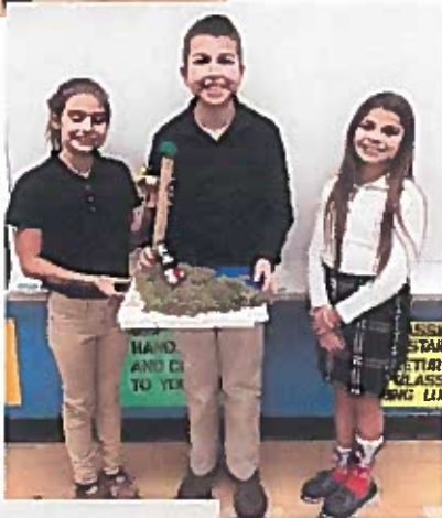
5 th Grade's Panda