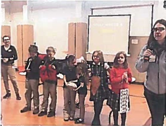
2 nd Grade w/Pre K Dr. Seuss Activity One Fish ... Two Fish ...