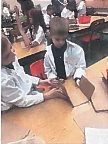
Collaborating, Communicating, and Problem-Solving.