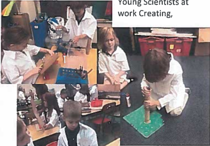
Young Scientists at work Creating,