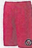
ITEM #ST355 PERFORMANCE SHORTS RED OR BLACK YOUTH S-XL: $15 ADULT S-XL: $15 XXL: $17 XXXL: $19