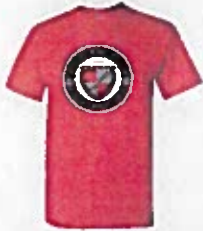
ITEM #5000 COTTON T-SHIRT RED, BLACK, WHITE, OR SPORT GRAY YOUTH S-XL: $11 ADULT S-XL: $11 XXL: $13 XXXL: $15