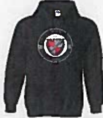
ITEM #18500 HOODED SWEATSHIRT RED, BLACK, WHITE, OR SPORT GRAY YOUTH S-XL: $23 ADULT S-XL: $23 XXL: $25 XXXL: $27