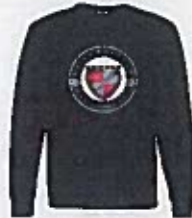
ITEM #5400 COTTON T-SHIRT RED, BLACK, WHITE, OR SPORT GRAY YOUTH S-XL: $15 ADULT S-XL: $15 XXL: $17 XXXL: $19