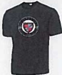
ITEM #ST350 PERFORMANCE T-SHIRT RED OR BLACK YOUTH S-XL: $14 ADULT S-XL: $14 XXL: $16 XXXL: $18