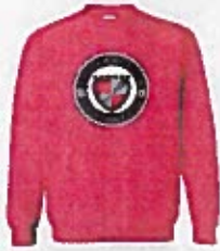
ITEM #18000 CREWNECK SWEATSHIRT RED, BLACK, WHITE OR SPORT GRAY YOUTH S-L: $18 ADULT S-XL: $18 XXL: $220 XXXL: $22