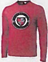
ITEM #ST350LS LONG SLEEVE PERFORMANCE T-SHIRT RED OR BLACK YOUTH S-XL: $17 ADULT S-XL: $17 XXL: $19 XXXL: $21