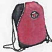
ITEM #BST600 CINCH BAG $12