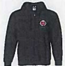
ITEM #18600 HOODED SWEATSHIRT WITH ZIP FRONT RED, BLACK, WHITE, OR SPORT GRAY YOUTH S-XL: $26 ADULT S-XL: $26 XXL: $28 XXXL: $30