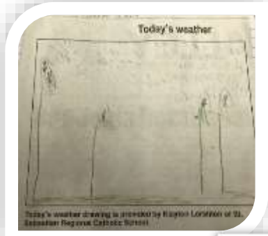
Klayton Loriston, Gr. 2