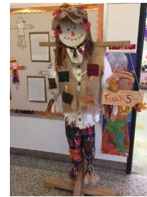
5 th Grade