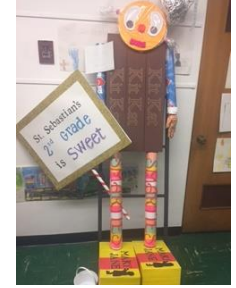
2 nd Grade