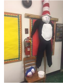
1 st Grade