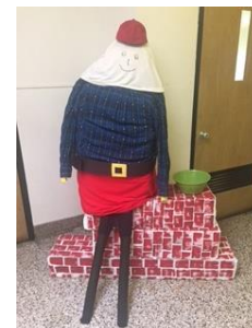
7 th Grade