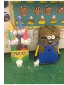
Pre – K