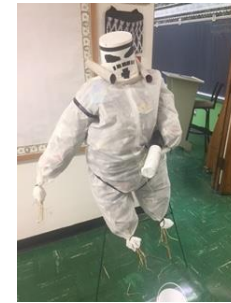
3 rd Grade