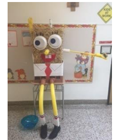
6 th Grade