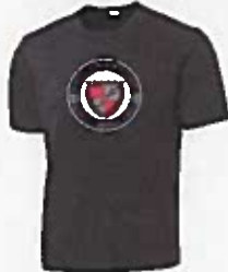
ITEM #ST350 PERFORMANCE T-SHIRT RED OR BLACK YOUTH S-XL: $14 ADULT S-XL: $14 XXL: $16 XXXL: $18