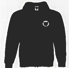
ITEM #18600 HOODED SWEATSHIRT WITH ZIP FRONT RED, BLACK, WHITE, OR SPORT GRAY YOUTH S-XL: $26 ADULT S-XL: $26 XXL: $28 XXXL: $30