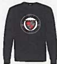
ITEM #5400 COTTON T-SHIRT RED, BLACK, WHITE, OR SPORT GRAY YOUTH S-XL: $15 ADULT S-XL: $15 XXL: $17 XXXL: $19