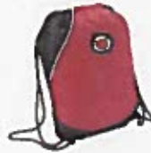
ITEM #BST600 CINCH BAG $12