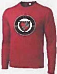
ITEM #ST350LS LONG SLEEVE PERFORMANCE T-SHIRT RED OR BLACK YOUTH S-XL: $17 ADULT S-XL: $17 XXL: $19 XXXL: $21