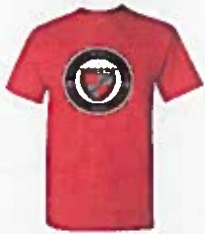
ITEM #5000 COTTON T-SHIRT RED, BLACK, WHITE, OR SPORT GRAY YOUTH S-XL: $11 ADULT S-XL: $11 XXL: $13 XXXL: $15