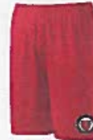
ITEM #ST355 PERFORMANCE SHORTS RED OR BLACK YOUTH S-XL: $15 ADULT S-XL: $15 XXL: $17 XXXL: $19