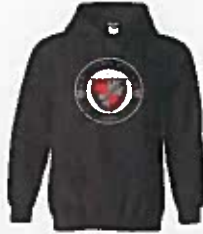
ITEM #18500 HOODED SWEATSHIRT RED, BLACK, WHITE, OR SPORT GRAY YOUTH S-XL: $23 ADULT S-XL: $23 XXL: $25 XXXL: $27