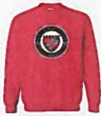
ITEM #18000 CREWNECK SWEATSHIRT RED, BLACK, WHITE OR SPORT GRAY YOUTH S-L: $18 ADULT S-XL: $18 XXL: $220 XXXL: $22