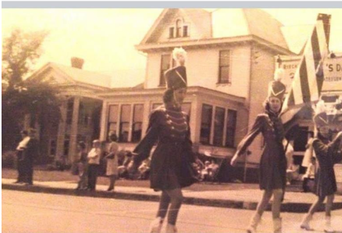
Parade on Broad Avenue in the town of North Belle Vernon, Westmoreland County in the 1940's. The house with the pillars to the left is where St. Sebastian's is located now.